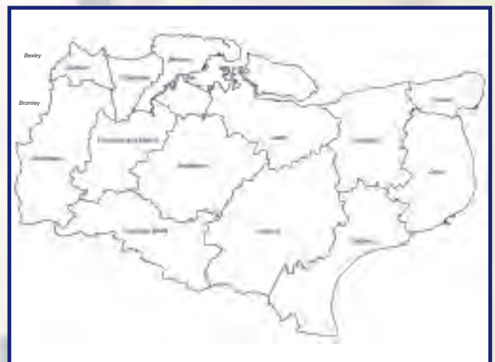
Figure 2 illustrates the KCFA's area of responsibility for football administration. It's responsibilities include the whole of the County of Kent and parts of the London Boroughs of Bromley and Bexley where clubs are affiliated to the KCFA.

The KCFA was formed in 1881 and has governed the game of football, under the aegis of The Football Association since that date. The Football Association governs football in this country. The responsibility for administering the game at local level is shared by 43 County Associations together with the Services and Amateur Associations. The Association became a Company Limited by Guarantee on November 1st 2000. Kent is the fifth largest County affiliated to The Football Association and is divided into four geographical divisions for administration purposes. There are 66 KCFA Council Members and 48 of these are elected to serve within the area that they live.